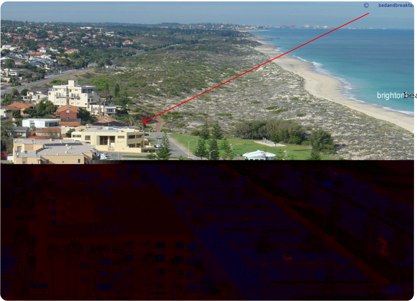
Brighton Beach south of Scarborough Beach, Perth