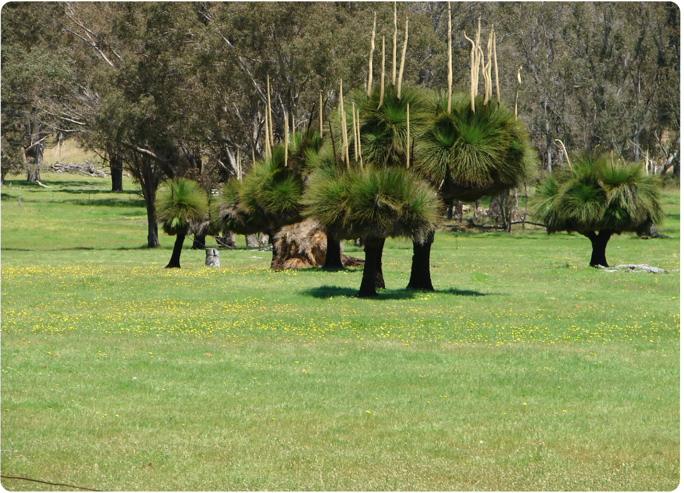
Beautiful blackboys (spear grass) in the Darling Range